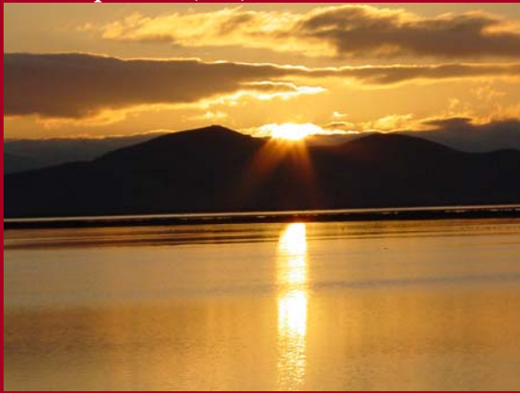
MHSA STAKEHOLDER PACKET